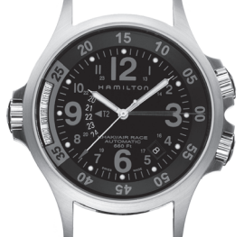
KHAKI GMT AIR RACE